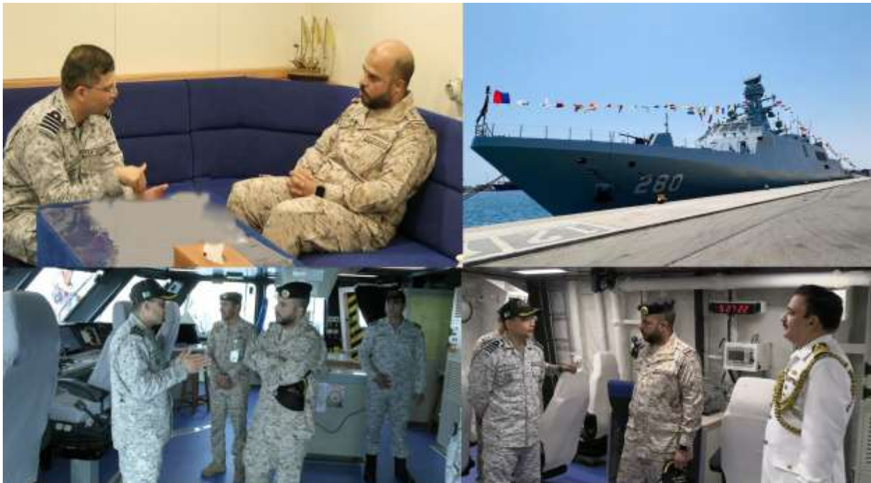
Senior official of Royal Saudi Naval Forces (RSNF) being briefed onboard PNS BABUR at Jeddah, Saudi Arabia