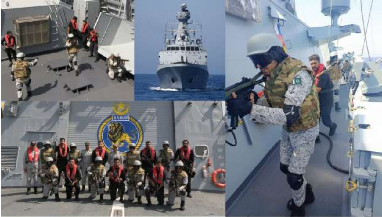
Pakistan Navy Ship BABUR conducts passage exercise (PASSEX) with Royal Saudi Naval Forces (RSNF)