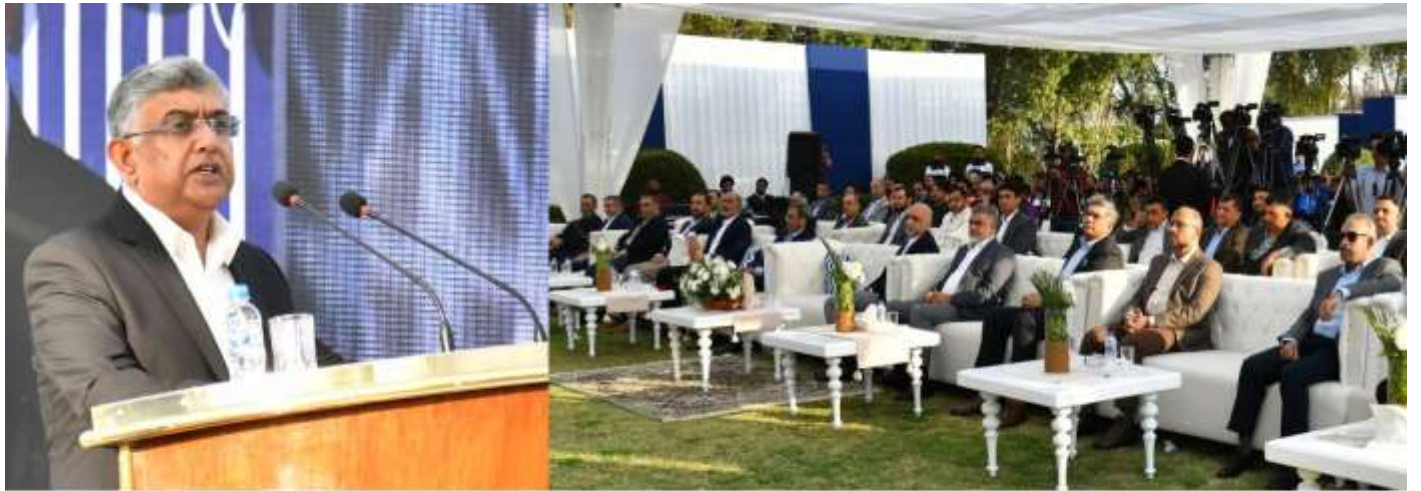
Chief of the Naval Staff Admiral Naveed Ashraf addressing the closing ceremony of 32 nd National Shooting Championship 2025 held at Karachi