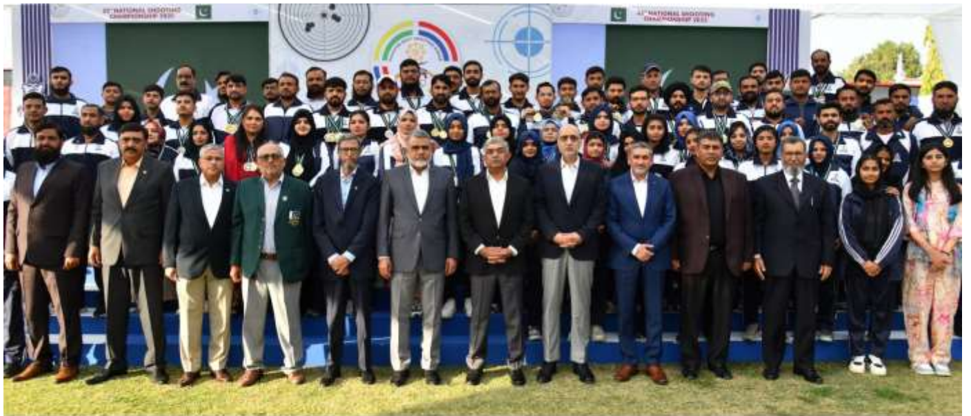
Chief of the Naval Staff Admiral Naveed Ashraf in a group photo with PN officials and prize winners of 32 nd National Shooting Championship 2025 held at Karachi